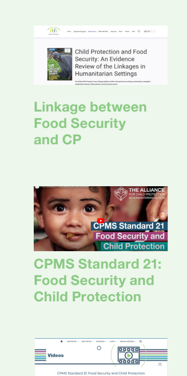
CPMS E-learning Course

Global Food Security Cluster YouTube channel